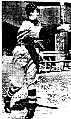
Babe Didrickson 1934