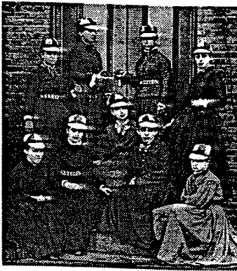
Vassar Resolutes 1866