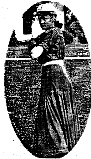
Alta Weiss 1908