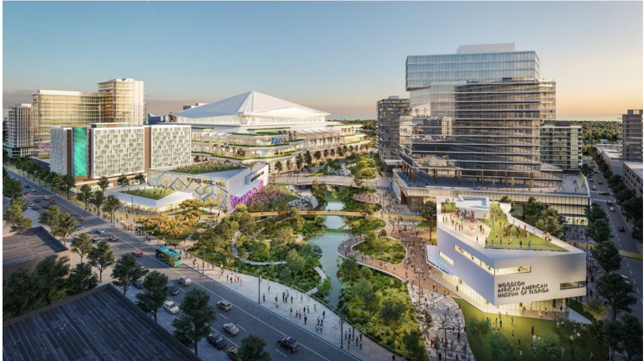
Renderings of the new ballpark and redeveloped Tropicana Field site in St. Petersburg proposed by the Tampa Bay Rays and Hines development company.