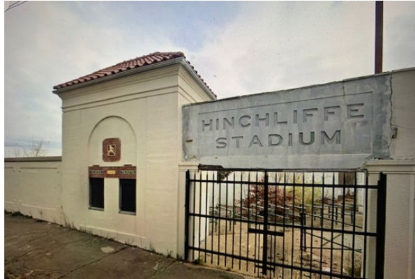
Left: Aerial photo of Hinchliffe Stadium with Great Falls in foreground; Right: Stadium entryway

McFARLAND BOOK ON CANDELSTICK PARK: James Forr is seeking out memories of Candlestick Park and has sent out the following communication: