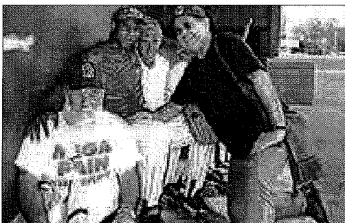
CubaBall participants in the dugout in Pinar del Rio's ballpark.

The success of the World Baseball Classic placed international baseball in the spotlight. It can no longer be claimed that the World Series represents baseball at its best.